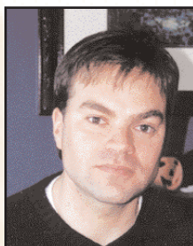
Pierre Des Rochers Roche Diagnostics