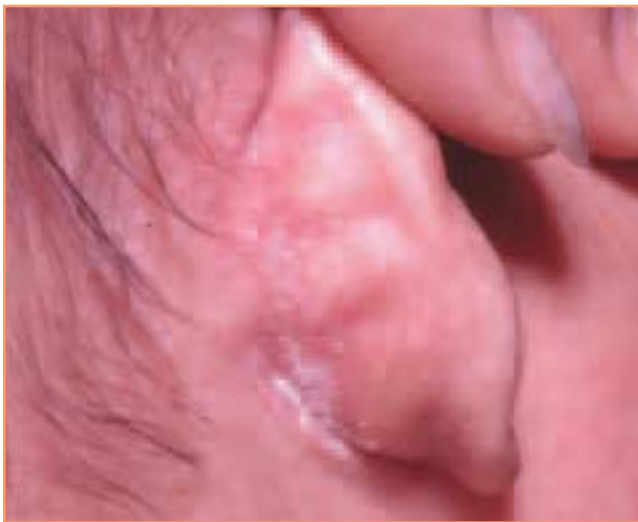
Figure 1. Retroauricular greasy patches (infant).

Seborrheic dermatitis (SD) is a chronic inflammatory skin disorder involving the regions of the skin bearing many sebaceous glands, as well as intertriginous areas in babies.