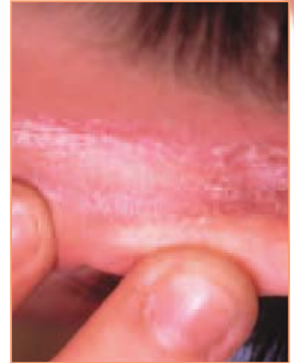
Figure 5. Typical scaling of the outer ear (adult).