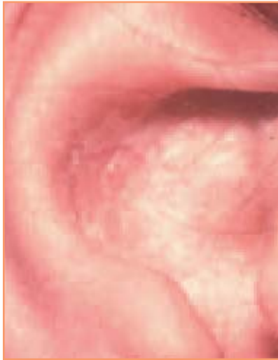
Figure 6. Retroauricular SD (adult).