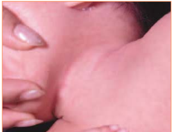
Figure 2. Post-inflammatory hypopigmentation of an infant neck.

SD is seen on the scalp (cradle cap), flexures, and diaper area in babies, usually clearing by six months of age. Adults may have fine scaling limited to the scalp (commonly called dandruff), or thick greasy-appearing patches of the scalp, ears, forehead, retroauricular sulci, nasolabial folds, and presternal regions.