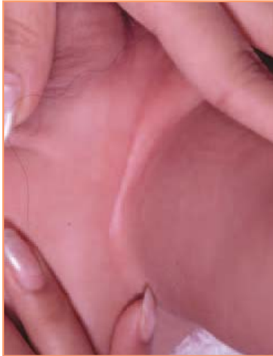
Figure 3. Erythema in the inguinal fold (spared in irritant contact dermatitis).