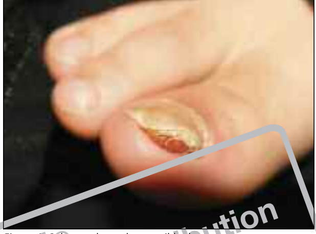
Figure 1. Subungual papule on nail bed

Subungual exostosis (SE) is a benign osteocartilaginous tumour first described by Dupuytren in 1817.