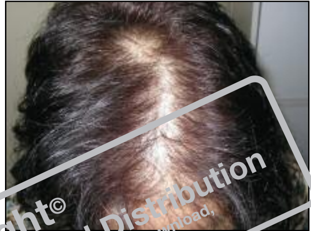
Figure 1: Hair loss on patient's scalp

Androgenetic alopecia (AGA) is a very common genetic condition affecting the scalp hair of approximately 50% of men and women over 40. The incidence of AGA in women dramatically increases after menopause. In addition to the cosmetic effects, hair loss allows more ultraviolet radiation to hit the scalp and thus increases the risk of skin damage and skin cancers. Caucasians are most affected, while Native Americans and Inuits are least affected.