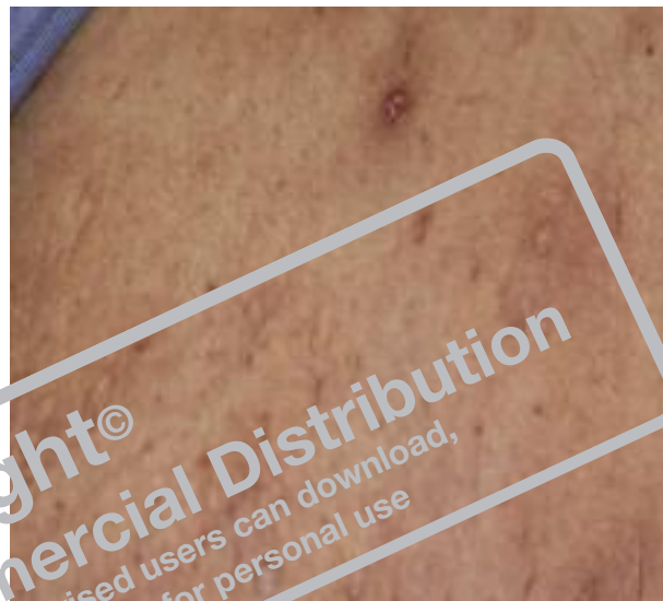
Figure 1: Lesions on patient's skin

Hidradenitis suppurativa is a chronic disease of the apocrine glands that is characterized by inflammatory nodules, papules, and often comedones and double comedones in the axillae and anogenital region. It is thought to be caused by keratinous plugging of apocrine ducts leading to duct dilation, as well as inflammatory changes supporting bacterial growth. Bacteria that often colonize the lesions