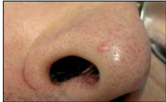
Figure 1. Papule on tip of nose.

A 36-year-old male presents with an erythematous dome-shaped papule on the tip of his nose that he has had for many months. It is asymptomatic and is not growing. He is concerned about a skin cancer. He is otherwise healthy. He admits to having worked as a life-guard in his teenage years and had several sunburns at that time.