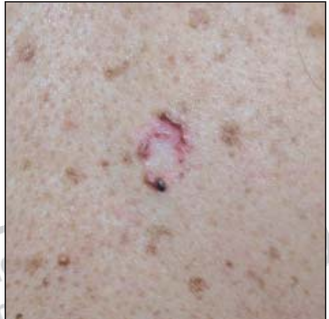
Figure 1. Patient showing lesion on his back.