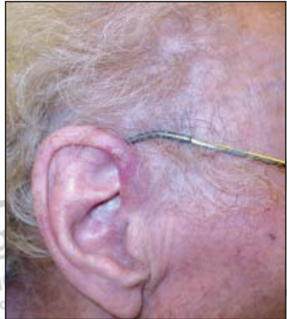
Figure 1. Patient showing persistent, painful, crusted nodule on the helix of his right ear.