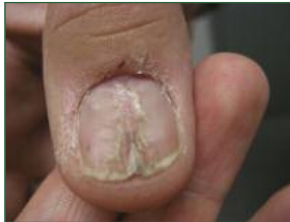
Figure 1. Rough split thumb nail