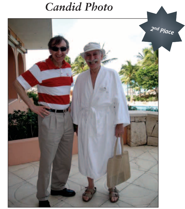
2nd-place