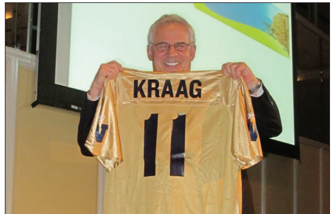
2011 Draft Pick